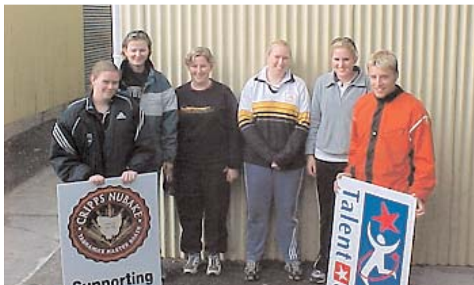
Some of the Talent Search support staff

The 2001/2002 Cripps Nubake Talent Search Development Squad was announced after phase two testing. The final squad included 65 athletes targeted for the sports