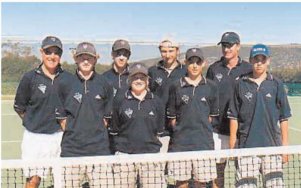
The first tennis Elite Development Squad began in January 2001.

These scholarships are provided to athletes from sports in which a small number of athletes are performing at the required level or where the sport does not have the infra-